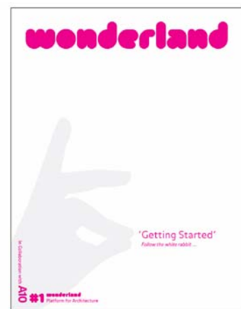
WONDERLAND magazine „getting started“

Its first issue of the magazine, which is published in cooperation with the A10 magazine, is available since May 2006, the next one will follow in January 2007. Therefore WONDERLAND invites young teams to participate - www.wonderland.cx/magazine