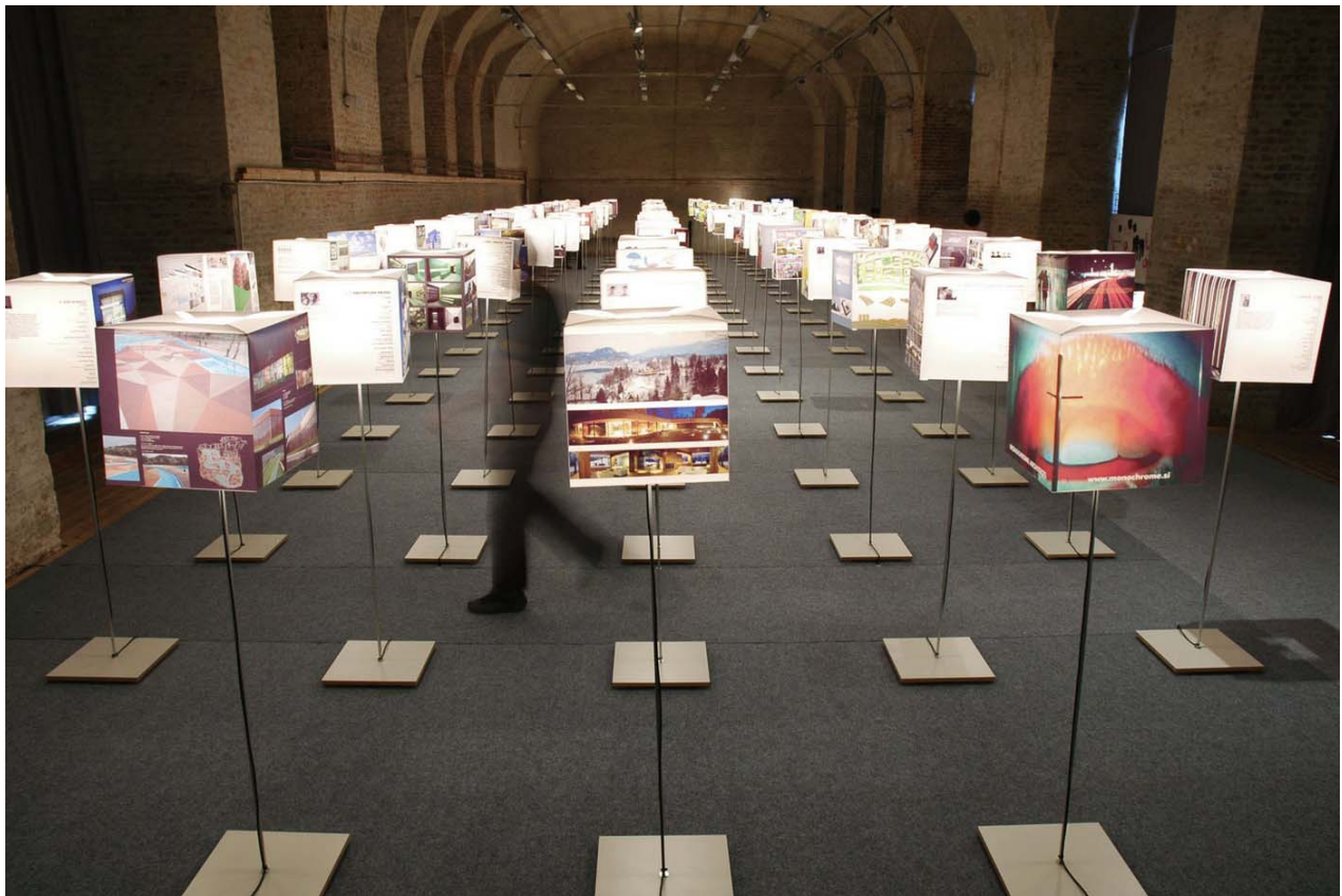
Wonderland Vienna 2006

guided tours on appointment T: +43 463 428210