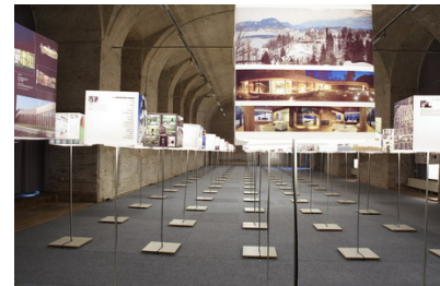
„Pixel lights“ im Architekturzentrum Wien

Ever since Vienna the exhibition concept of presenting the team exponents on the so-called Pixels has been changed. The pixels have been moulded into a floor-lamp – called „Pixel-Light“ – with the teams' works printed onto the lampshade. Each Pixel-light stands for one teams. The lamps can be purchased at www.wonderland.cx .